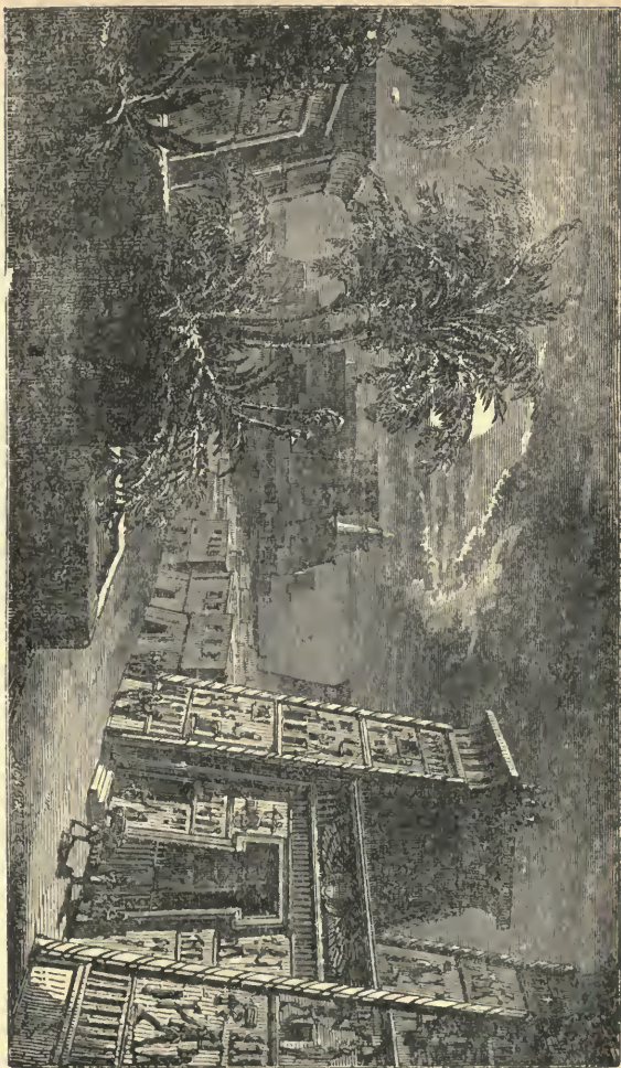
CLEOPATRA ENTERING THE PALACE OF CESAR.