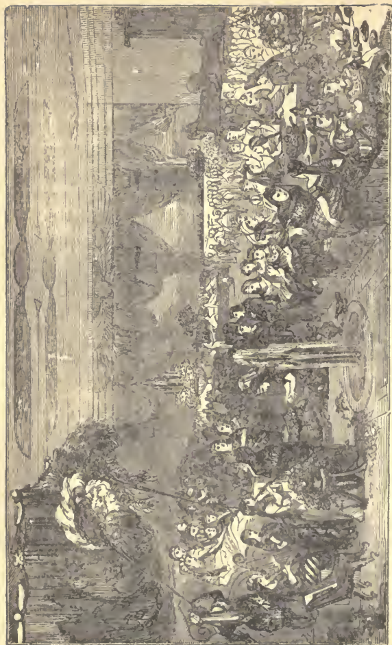
THE BIRTH-DAY PRESENT