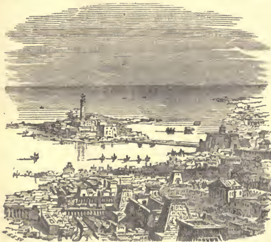
VIEW OF ALEXANDRIA.

The Egyptians thus commanded the entrance to the mole. The island itself, also, with the fortress at the other end of the pier, was still in the possession of the Egyptian authorities, who seemed disposed to hold it for Achillas. The mole was very long, as the island was nearly a mile from the shore. There was quite a little town upon the island itself, besides the fortress