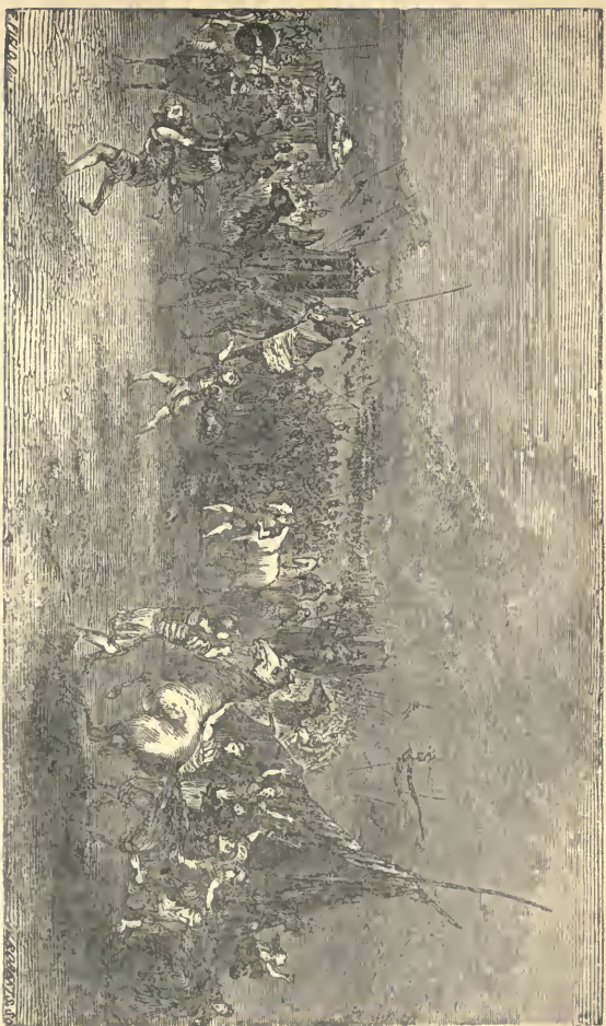
ANTONY CROSSING THE DESERT.