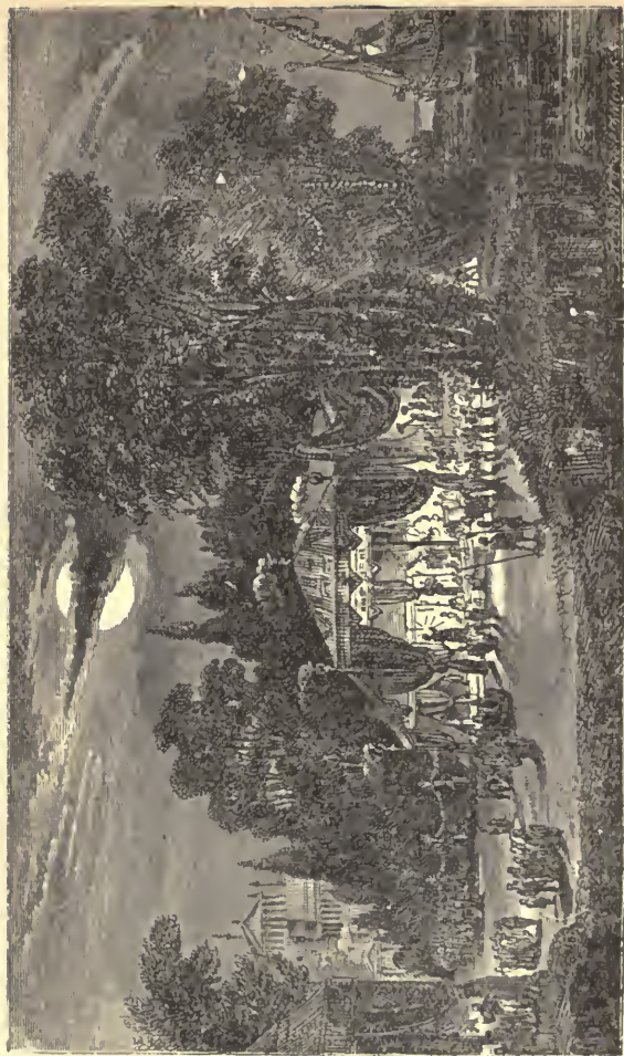
THE ENTERTAINMENTS AT TARSUS.